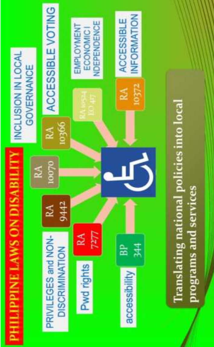
Overview of the Philippine Disability Laws